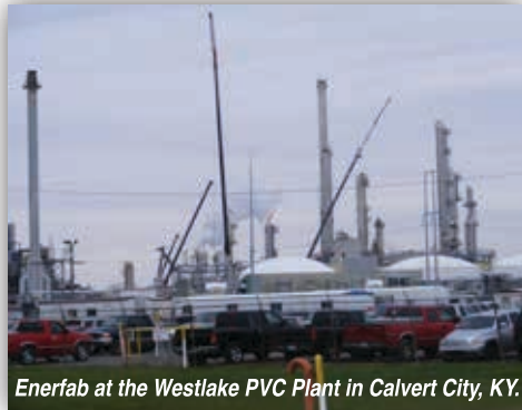
Energfab at the Westlake PVC Plant in Calvert City, KY.

We would like to take this opportunity to remind all members to keep certifications, physicals and BOLT drug cards current. Please remember to call your District office to notify of telephone number and address changes.