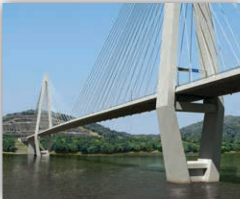
The new Ironton Russell Bridge.

Our road work has slowed down, but Hi-View is continuing work on the Mountain Parkway and in Floyd and Pike Counties. Kokosing's job in Pike County has several operators at this time, but should wind up this year.