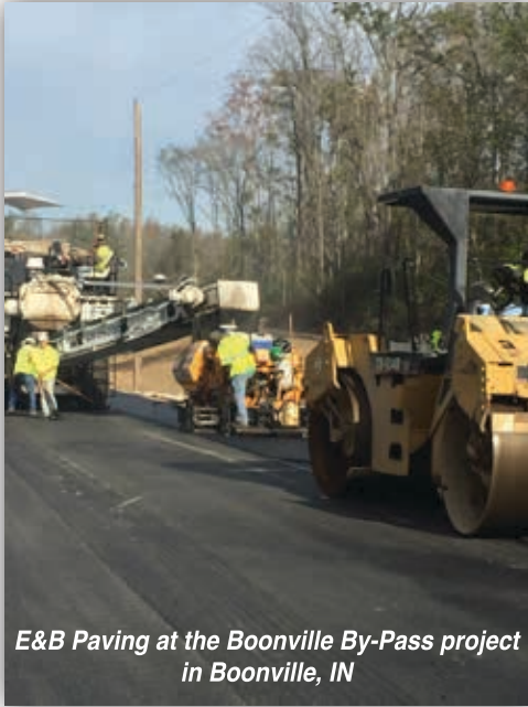
E&B Paving at the Boonville By-Pass project in Boonville, IN

In closing we would like to remind everyone