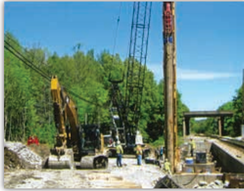
Ragle, Inc. at the CSX Railroad Bridge project in Hopkins County, Kentucky.

In Daviess County, PPMI has some work in Owensboro at the Max Rhoades Waste Water Treatment Plant. G&M Steel is finishing their