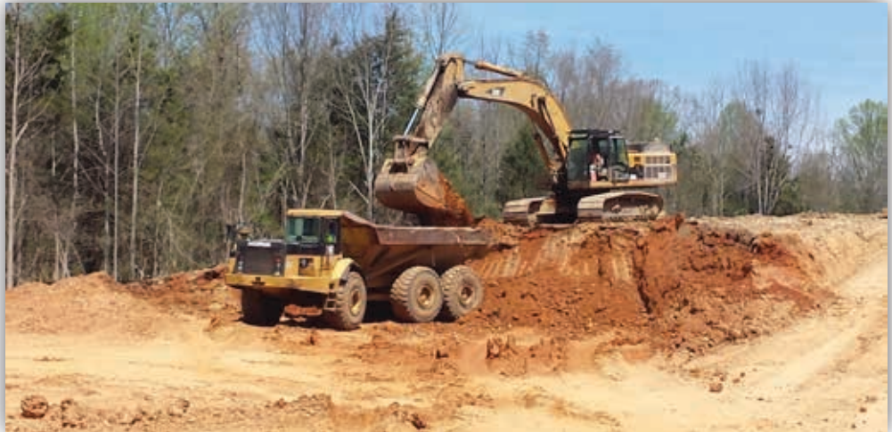
Hi-View on Highway 27 in Jamestown, KY