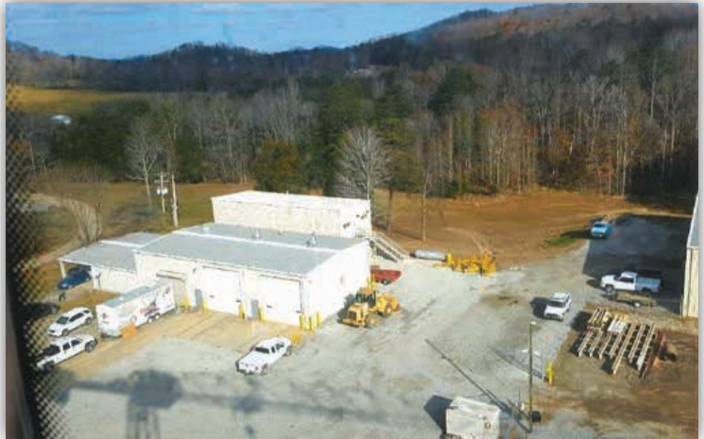
View of Boston Training Site from the tower crane.

This is the time of year when training at the sites is starting to wind down allowing us time to prepare for the fall classes. Our mandatory apprentice classes will begin at the first of 2018 and we expect that to be a very busy training season. Our indoor training facility continues to be a priceless asset during wet and rainy periods again this year.