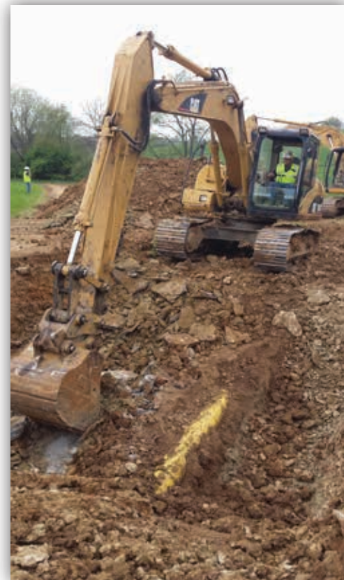
Contractors Rental on the pipeline job in Carlisle, KY

members to register every six months and attend their monthly district meetings held the first Tuesday of each month, except June and December. Remember, you are the Union.