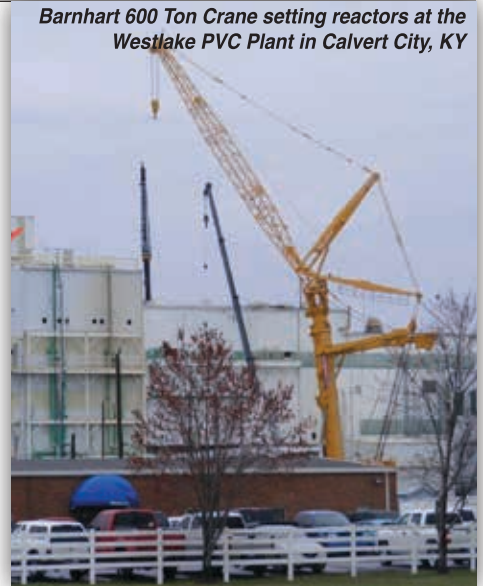
Barnhart 600 Ton Crane setting reactors at the Westlake PVC Plant in Calvert City, KY

In closing, I would like to encourage all members to attend all District meetings held on first Tuesday of each month (except June and December) meetings are held at the AFL-CIO Building located at 1202 S. Fourth Street, Paducah, KY at 7:30 P.M.