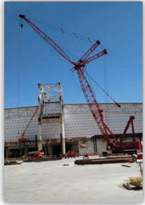
Midwest Steel working on Kentucky International Convention Center in Jefferson County, KY

Dave O'Mara Contractors have multiple projects throughout southern Indiana. At this time, they are working on a parking lot addition at Cummins in Walesboro. They are also installing a new water intake system at the old Hanson Quarry Lake in North Vernon and have started a road improvement project in Brookville. Other projects include the finishing of the Highway 50 By-Pass in North Vernon, and multiple water lines in Jeffersonville. Dave O'Mara was awarded the 10th Street widening project in Jeffersonville, IN.