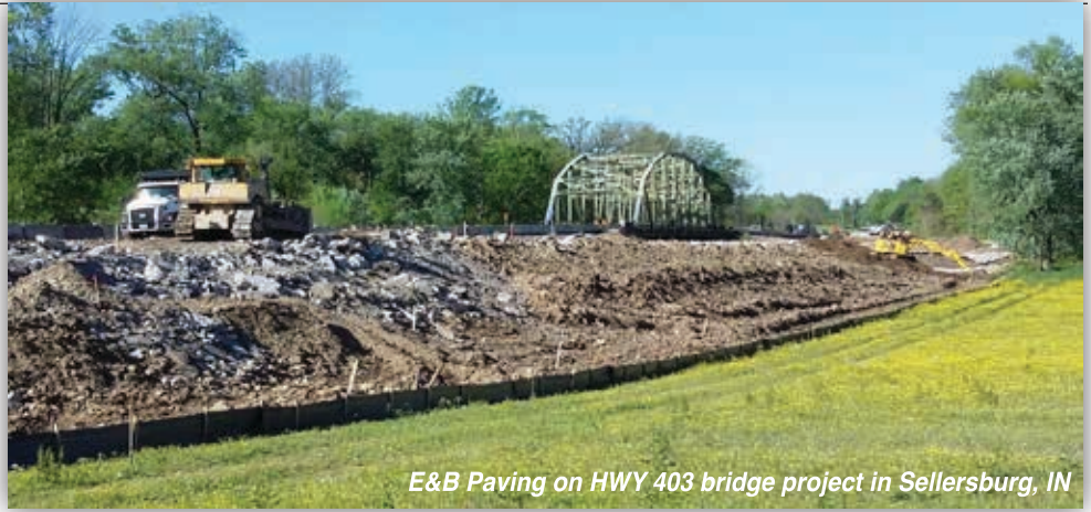
E&B Paving on HWY 403 bridge project in Sellersburg, IN

In closing, I would like to invite everyone to the monthly District meetings held in Louisville on the 1st Tuesday and Elrod, IN on the 2nd Tuesday of the month (except in June and December). If we can be of any assistance, please give us a call at 502-636-1476. ♦