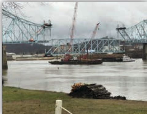
The old Ironton Russell Bridge coming down.