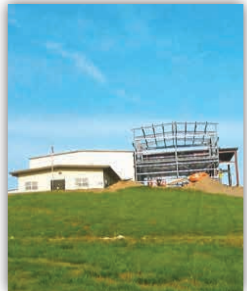
The Lynnville Training site new classroom building under construction.

Remember, your skills are what makes your paycheck. If you need to recertify a skill, come to the Lynnville or Boston Site and we will help you get that taken care of. If you have any questions or concerns, please feel free to contact the Lynnville Training Site at 812-922-5541 or the Boston Training Site at 502-833-2358. Our office is open Monday- Friday 7:00 am - 3:30 pm. ♦