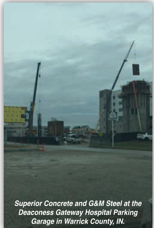
Superior Concrete and G&M Steel at the Deaconess Gateway Hospital Parking Garage in Warrick County, IN.