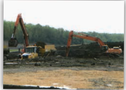
Trans Ash working on the Slag Mountain Phase 1 project at TVA Paradise.

We also want to remind everyone that our monthly District meetings (except June and December) are held in Henderson, KY at the Headquarters Office on the first Tuesday of the month at 7:30 P.M. and at the Bowling Green, KY Office on the second Tuesday of the month at 7:30 P.M. If we can be of any assistance, please give us a call at 270-826-2704. ♦